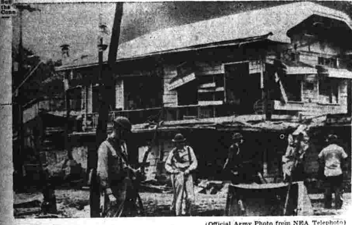
The photo above, one of the first received since the war hit the Philippines, shows American soldiers looking over bomb damage after Japanese attack on the Philippine town of Parangue.

Where Jap Bombs Hit Philippines Corregidor, After First Jap Attack Christmas Day—in the Philippines